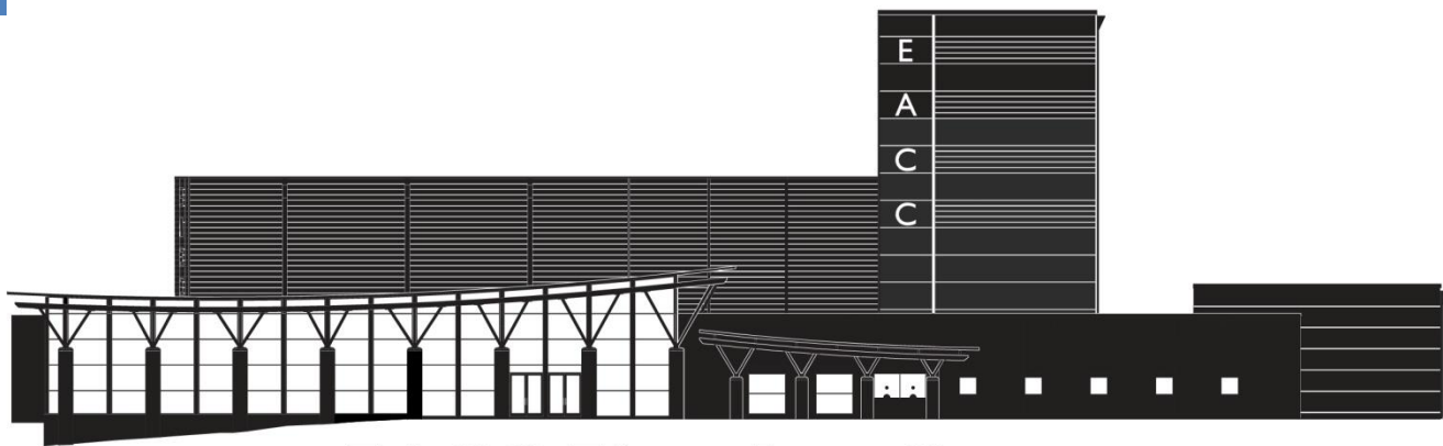
EACC Fine Arts Center